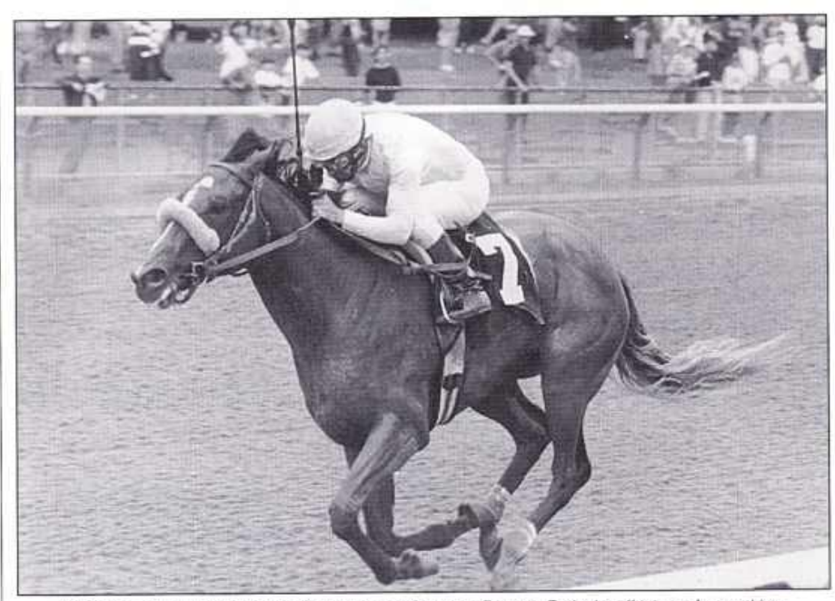
When Casa Eire won the Astoria Breeders' Cup Stakes at Belmont Park, the effect was far reaching.